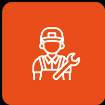
General / skilled Labourers