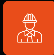
Safety Officers/ Auditors